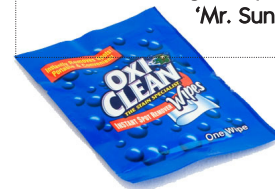
Idea: OxyClean super condoms, for your sexy OCD friends!